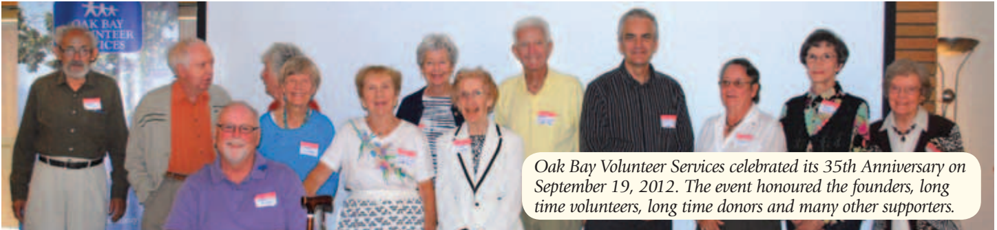
Oak Bay Volunteer Services celebrated its 35th Anniversary on September 19, 2012. The event honoured the founders, long time volunteers, long time donors and many other supporters.